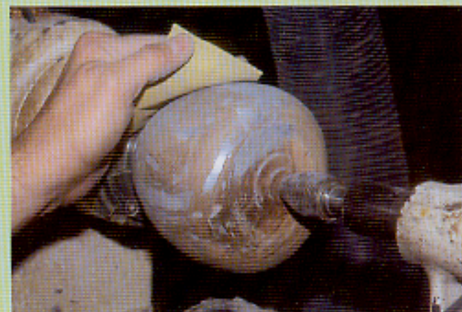
11 Use coarse sandpaper to get rid of excess filler without chipping

make a lot of brass grindings – and epoxy cement.