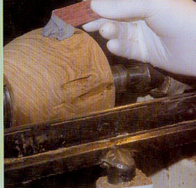
7 Using a spatula, force the filler material into the flaws