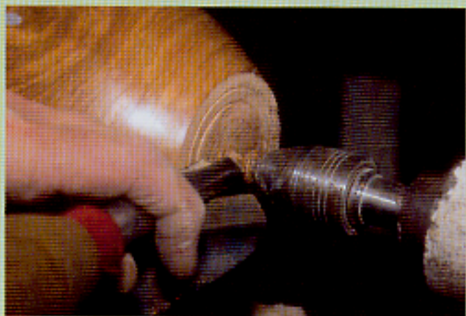
16 (above) Cut a couple of decorative grooves to the bowl bottom...