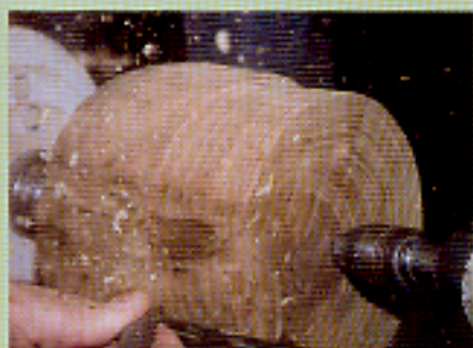
1 Turn the wood round between centres