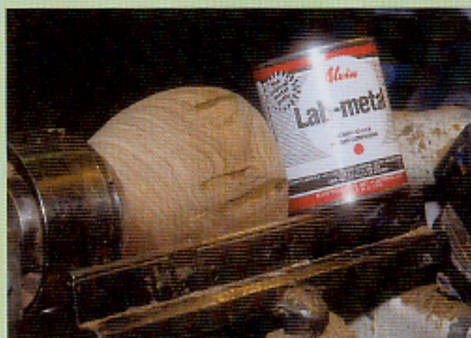
6 Lab Metal has a thick consistency that is easy to apply