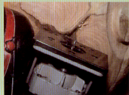
5 (below) A small router fitted with a spiral bit is useful for cleaning up or creating flaws

is that attractive bowls can be made from a worm-eaten 'ugly duckling' piece of wood which would ordinarily be consigned to the fireplace. Making a beautiful bowl from such a compromised piece of wood is what we will do in this project.