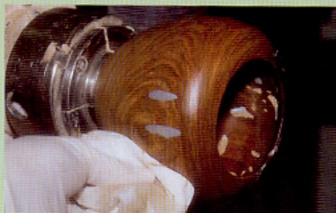
15 Sand and apply finish while the bowl is on the lathe