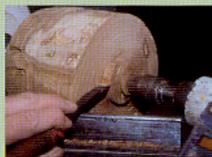
2 Turn the tailstock end flat and prepare it for your faceplate or four-jaw chuck