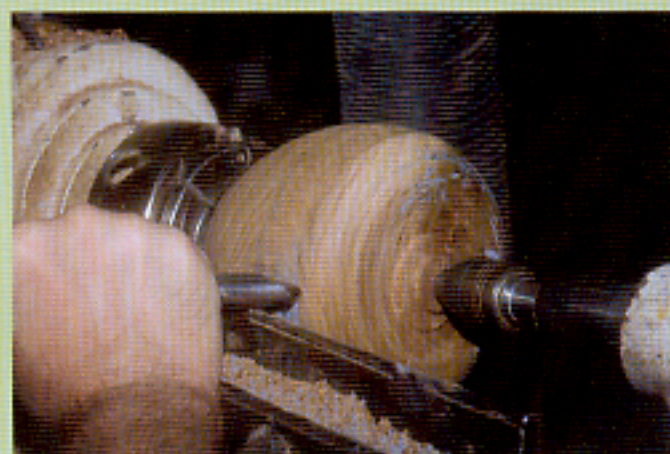
10 Do some initial shaping with sandpaper before the Lab Metal has fully hardened