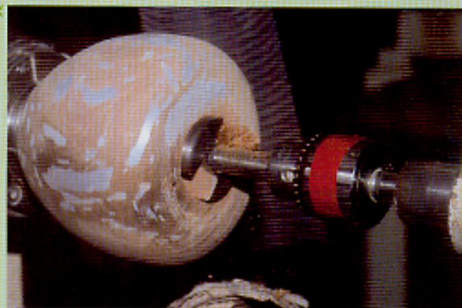
13 Using a Forstner bit to make the initial cut on the inside of the bowl