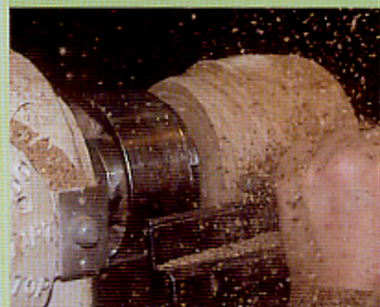
4 (left) Using the side of the bowl gouge, make fine finish cuts